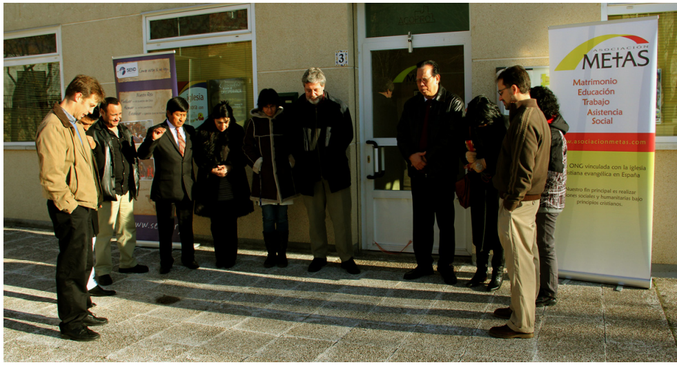
Photo: METAS Building in Guadalajara

So when SEND missionaries entered Guadalajara, Spain, they looked for ways to build that trust. Eventually the idea for METAS was born.